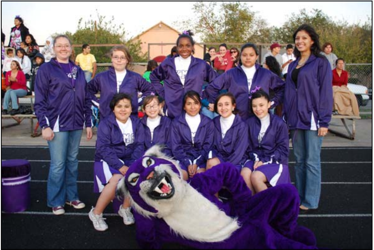
Meet Willy Wildcat...